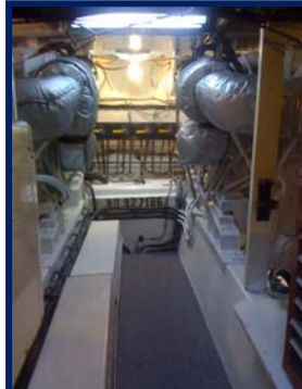
Forward Engine Room